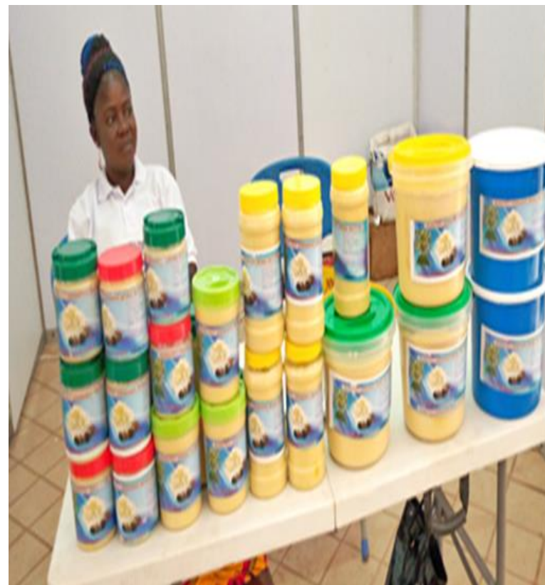
Group exhibiting their sheabutter at a KOICA supported fair and exhibition event