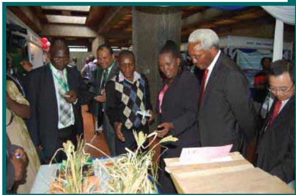
Minister for Science & Technology visiting farmers Innovation at KICC exhibition 2011