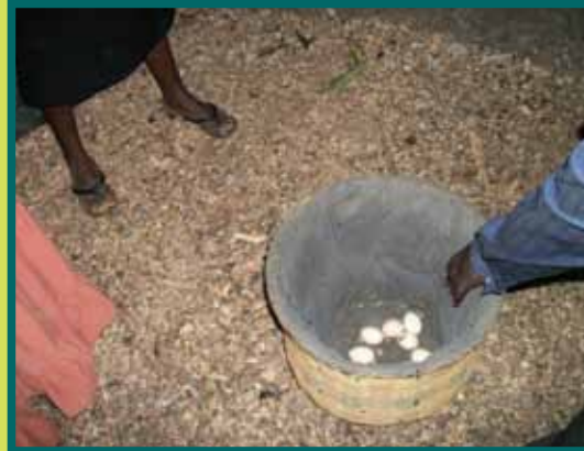
Fireless cooker basket used to hatch Eggs