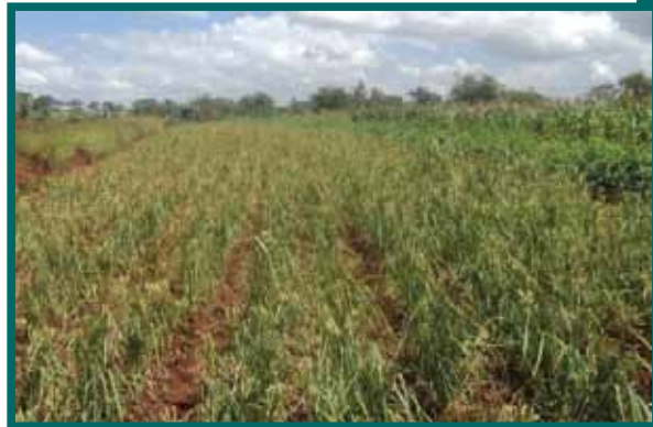
Established finger millet from nursery