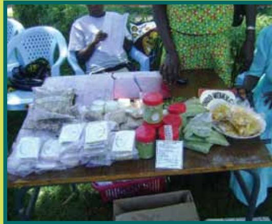
Exhibition during Innovation Fair