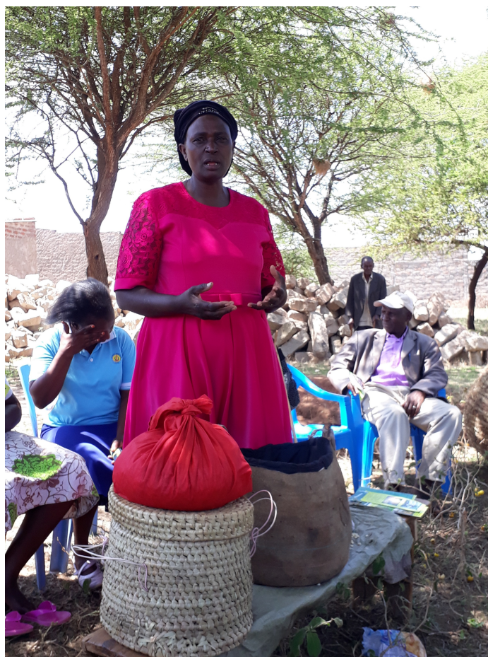
Woman in Makueni, Kenya, explaining her innovation to a group of ARD practitioners