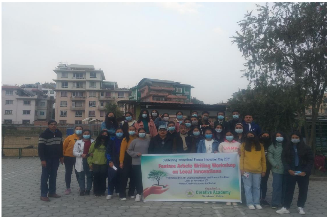
Students of Creative Academy at IFID celebration

On 27 November 2021, Creative Academy, a secondary school in Kirtipur municipality, Nepal, celebrated IFID by organising a "Writing workshop on local innovations". The main purpose of this event was to build the capacity of students in writing feature articles on local innovation.