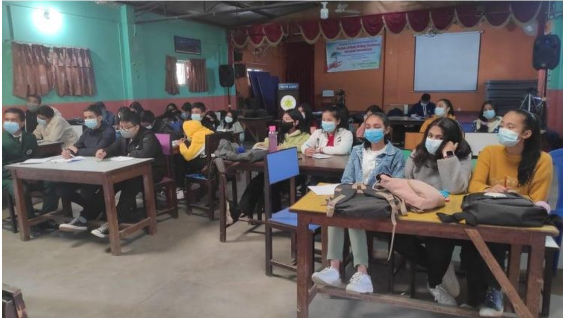
Student participants in feature article writing workshop

that can be used as a reference book for schools in Kirtipur municipality. The book launch is planned for April 2022. Creative academy will publish and sell the book and the proceeds will be used as a seed fund to provide similar writing workshops on local innovation to students of other schools. In closing, Dharma Dangol extended many thanks to the staff and family of Creative Academy for celebrating IFID 2021 in a new and innovative way.